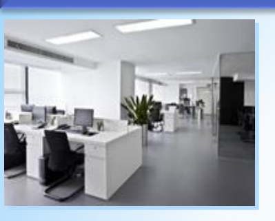
Auto Attendant / Voice Mail