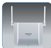
KX-TDA0156 4ch Cell Station