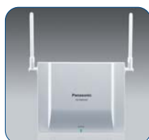
KX-TDA0155 2ch Cell Station