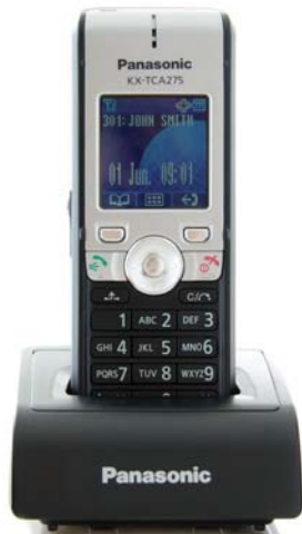
KX-TCA275 Compact Business Model