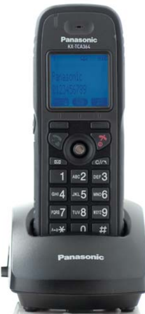
KX-TCA364 Tough Type Model