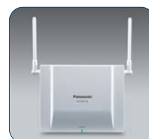
KX-TDA0158 8ch Cell Station