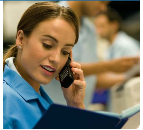
BUSINESS DECT BROCHURE