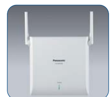
KX-NCP0158 8ch IP Cell Station