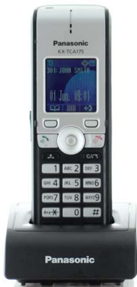
KX-TCA175 Standard Model